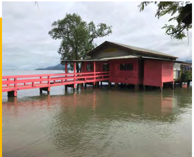
After the renovations