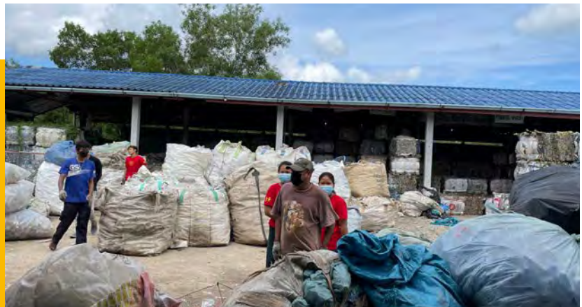
The center for the recovery and collection of oceanic plastic waste.