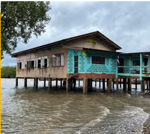
Before the renovations

A team of volunteers coordinated the work with the Moken. The contributions of the friends of the Foundation have made it possible to finance this work. Your contribution is invaluable to us in order to continue to monitor the projects carried out.